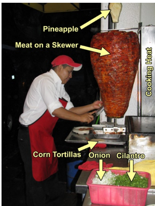
Right: Making tacos al pastor at "La Gringa" taqueria in Cuernavaca

What's a Mexican taco (vs. "Tex-Mex" or Taco Bell®)? Often two soft corn tortillas folded with meat, chopped onion, and cilantro. In Mexico, one favorite is Tacos al Pastor (see pic) with marinated meat sliced from a skewer and slices of pineapple on top.