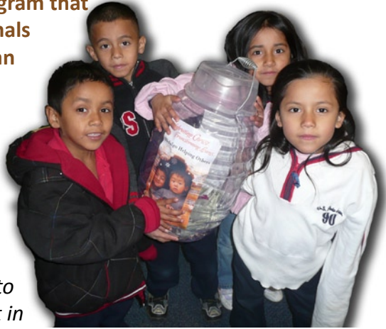
Kids with the giving jar

** Parents got involved too. For example, one mom runs a small "restaurant" and got her patrons to give. Several other moms brought in donations as well.