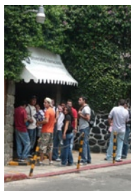
2nd Row: signs (notice Hidalgo street sign on wall); students at entrance to La Universidad ("Uninter" -- my language school). 3rd Row: Downtown Cuernavaca; "Thanks for speaking Spanish" sign in Uninter's conversation practice garden.