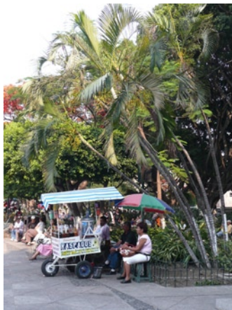
Top row: Trying pickled pig's feet; helping at a local church outreach; Cuernavaca's zocalo "town center".